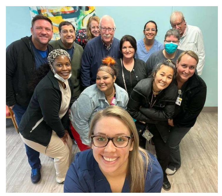
The Dental Team!